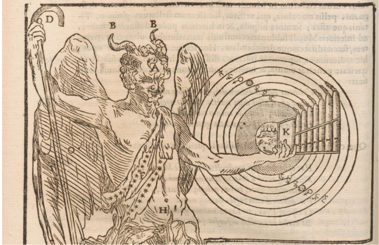
Tomi Secundi Pars Altera of same book has other septenary illustrations, such as